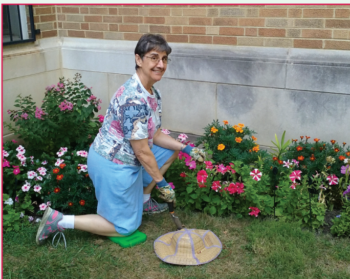
Sr. Dolores brightens the east side of the building ...including the area around the holly bushes.