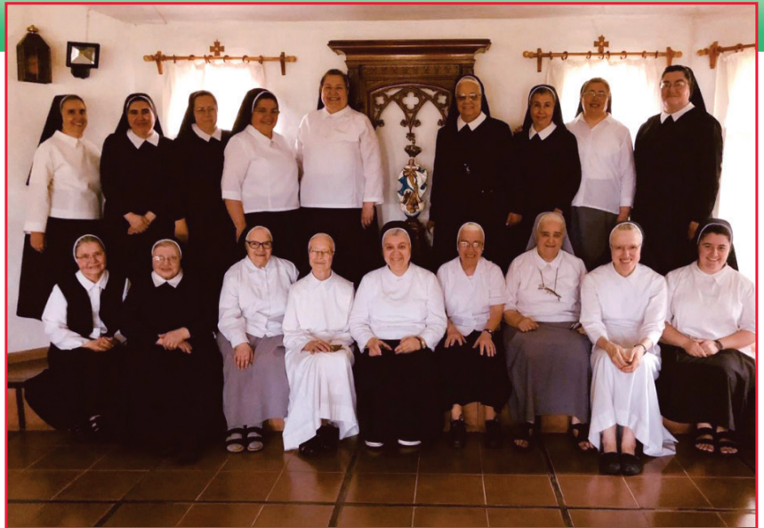
The Sister retreatants gather in the chapel of the Retreat House of the Good Shepherd in Uruguay. Since the motherhouse was sold, this is the site where the Sisters go for their annual retreat. It is located in the countryside, about five or six acres, and is a really beautiful and peaceful place.