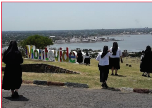
After the retreat, the Sisters made a visit to the Marian Sanctuary and the school in Santa Lucia. They also saw some of the sights of Montevideo.