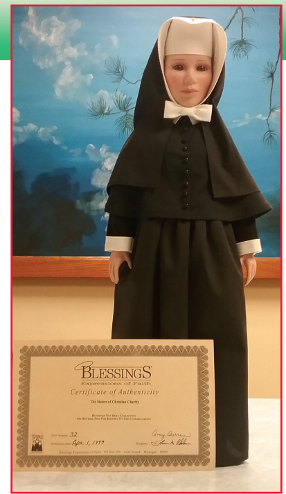
The Sisters of Christian Charity doll from the Blessings Nun Doll Collection. The doll stands 18 inches tall.