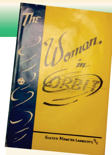
The original book jacket.