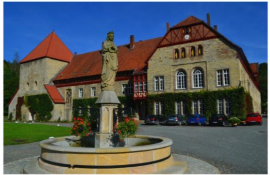
Boeddeken as it appears today